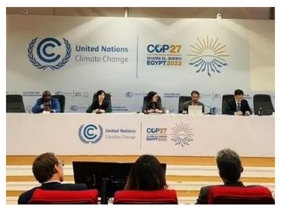
UNFCCC COP27 side event entitled "NGOs Help Developing Countries Adapt to Climate Change: Policy, Investment and Financing"

On 11<sup>th</sup> November, China Association for NGO Cooperation (CANGO), Humana People to People (Switzerland), the Bangladesh Local Environment Development and Agricultural Research Society (LEDARS) and Sichuan's Green River co-hosted a side event entitled "NGOs Helping Developing Countries Adapt to Climate Change: Policy, Investment and Financing" during the UNFCCC COP27. Government representatives and NGOs from China, Angola, Bangladesh and India introduced their national policies on climate adaptation and finance, shared exemplary cases of NGOs, and discussed opportunities, challenges and the future of NGOs in southern countries to contribute to climate adaptation actions.