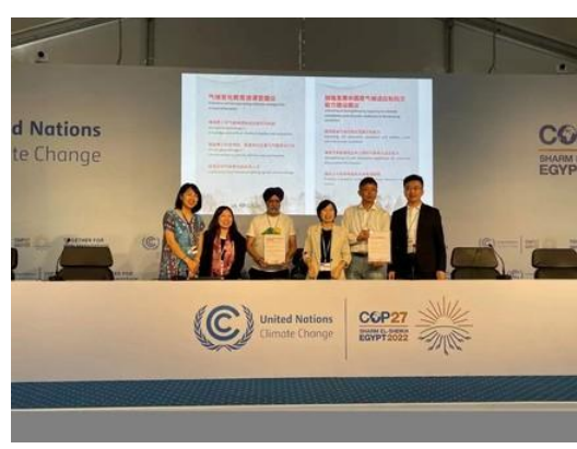
At the press conference of UNFCCC COP27, all parties jointly issued the "Initiative for Improving Response and Adapting to Climate Change".

On 12<sup>th</sup> November, CANGO and China NGO Network for International Exchanges(CNIE) held a press conference on UNFCCC COP27, and jointly launched the Initiative on Strengthening Climate Adaptation and Disaster Resilience in Developing Countries , calling for greater global awareness and capacity to prevent extreme climate risks and foster stronger resilience for climate-vulnerable areas and populations, and building a beautiful homeland of harmonious coexistence between human and nature.